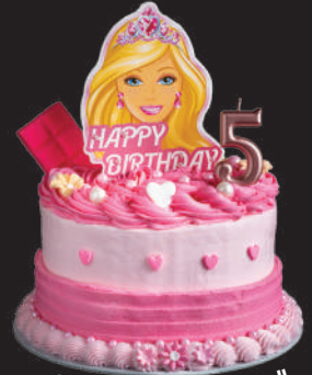
20 cm round & 12 cm tall