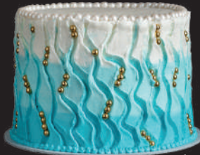
20 cm round & 15 cm tall