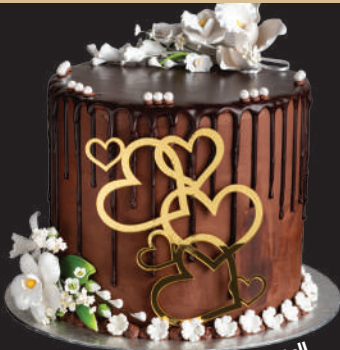
20 cm round & 17 cm tall